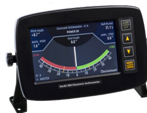
Bracket mounting model