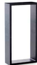
Foundation for Alarm Unit: 812 and Selector Unit: 813