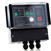
BW-800 in Wall Mounting Box 810 IP65