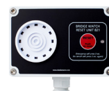
Reset Unit with audio alarm for bridge wing