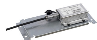
Sensor Unit with mounting plate