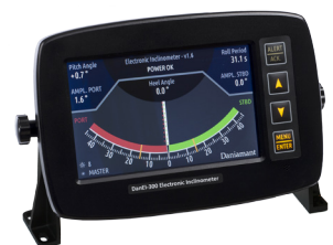
Bracket mounting model