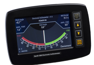
Panel mounting model