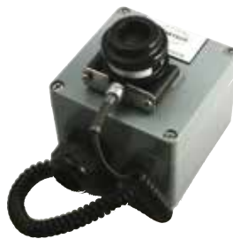
Microphone station 1176 single system