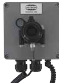
Microphone station 1808 dual system