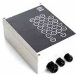
6112 W.P. unit without handset