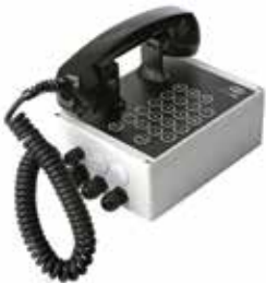
6111 W.P. unit w/handset