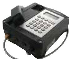
RESISTEL EX Telephone Fernsig