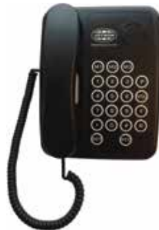
6110 MkII Indoor unit