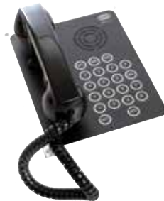
5113 / 5123 / 6113 / 6123 Telephone