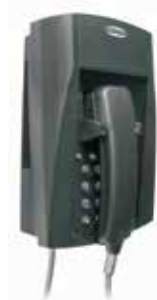
5111 Watertight telephone