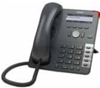
Snom 710 IP telephone