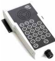
6124 W.P. unit