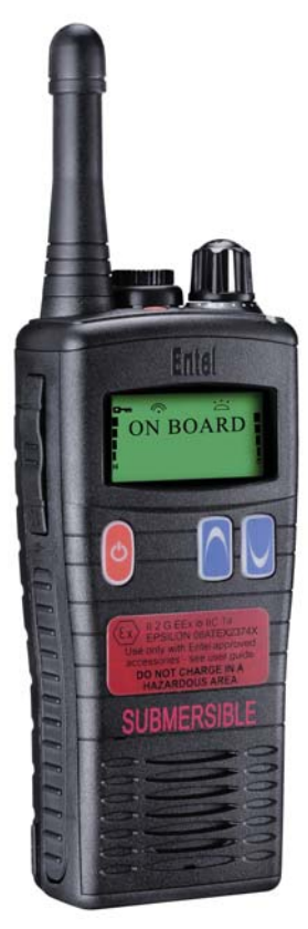
Pictured: UHF ATEX variant with stubby antenna