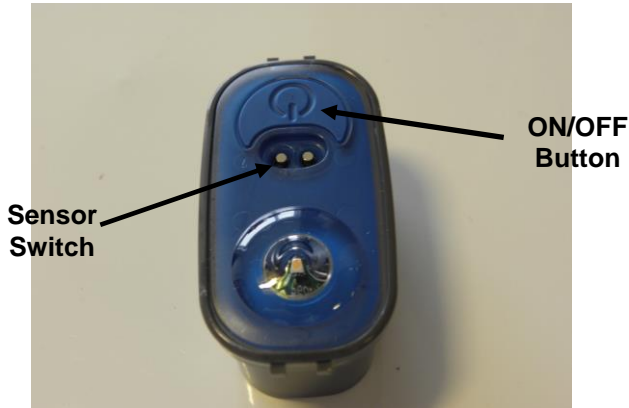
Figure depicts the Sensor Switch and the Manual ON/OFF Button

The DAN WR3 is switched on automatically when the sensor is immersed in water, and can be switched off by pressing the on/off button *for one second. The light can also be activated and deactivated manually by pressing the on/off button*.