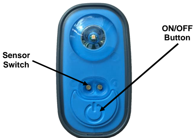
Figure depicts the Sensor Switch and the Manual ON/OFF Button