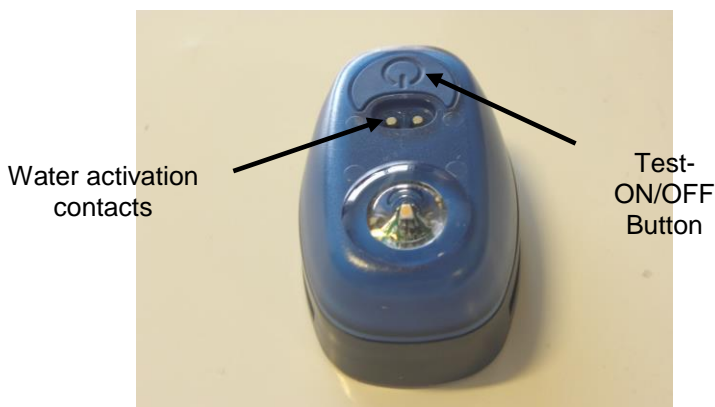
Figure depicts the Water activation contacts and the Manual Test Button

The light can also be activated and deactivated manually by pressing the test-on/off button.