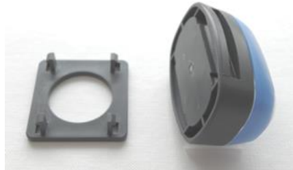
Light and fixing clip (part no. 1950 for grey standard clip) separated to show material path.

The Dan W3 is supplied with a fixing clip. The clip is intended to be placed behind a strip of lifejacket material or reflective tape; the light is secured by pressing it into the clip.