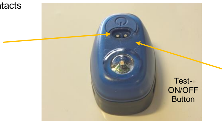
Figure depicts the Water activation contacts and the Manual Test Button.