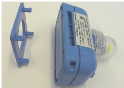
Light and Fixing clip separated to show material path.

The Dan W2 is supplied with a fixing clip. The clip is intended to be placed behind a strip of lifejacket material or reflective tape; the light is secured by pressing it into the clip.