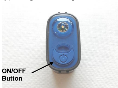
Figure depicts the manual 'ON/OFF button'.

The DAN MR3 is switched on by pressing the on/off button for *one second and can be deactivated by pressing* the button again.