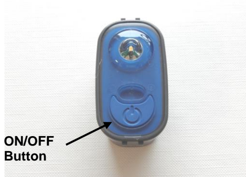
Figure depicts the manual 'ON/OFF button'.

The DAN MR3 is switched on by pressing the on/off button and can be deactivated by pressing the button again.