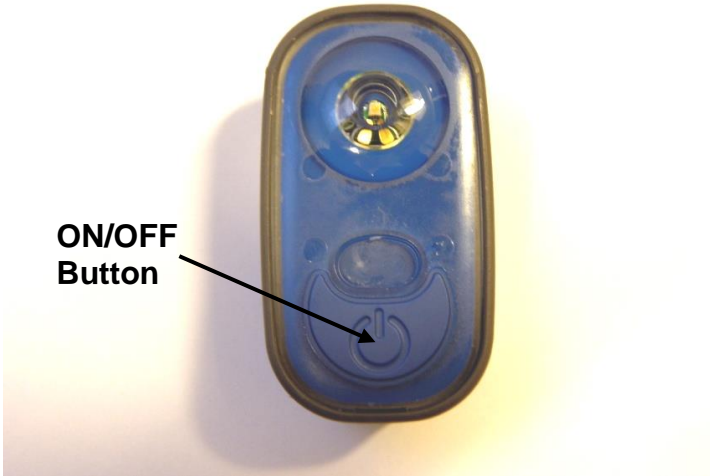
Figure depicts the manual 'ON/OFF button'.

The DAN ML3 is switched on by pressing the on/off button and can be deactivated by pressing the button again.