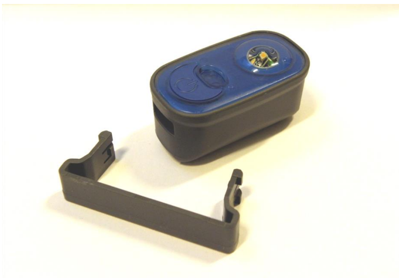
Clip part no.1960

The ML3 is a Leisure and Inflatable Lifejacket version of the M3 Light. It is the responsibility of the lifejacket owner to ensure that the light is attached securely and is in the correct position on the lifejacket to provide maximum visibility when the wearer is in the water. Place the unit on a strap and insert the clip from below until it locks in place.