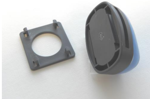
Light and fixing clip (part no. 1950 for standard grey clip) separated to show material path.

The Dan M3 is supplied with a fixing clip. The clip is intended to be placed behind a strip of lifejacket material or reflective tape; the light is secured by pressing it into the clip.