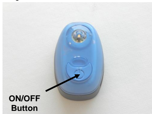
Figure depicts the manual 'ON/OFF button'

The DAN M3 is switched on by pressing the on/off button and can be deactivated by pressing the button again.