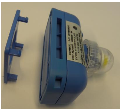
Light and Fixing clip separated to show material path.

The Dan M2 is supplied with a fixing clip. The clip is intended to be placed behind a strip of lifejacket material or reflective tape; the light is secured by pressing it into the clip.