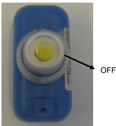
Figure depicts the unit in the 'OFF' Position

The light can be turned off by rotating the dome anti-clockwise