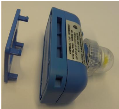
Light and Fixing clip separated to show material path.

The Dan M2 is supplied with a fixing clip. The clip is intended to be placed behind a strip of lifejacket material or reflective tape; the light is secured by pressing it into the clip.